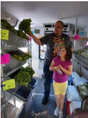
Two of our new weekly shoppers at the Ada County Boys & Girls Club in Garden City